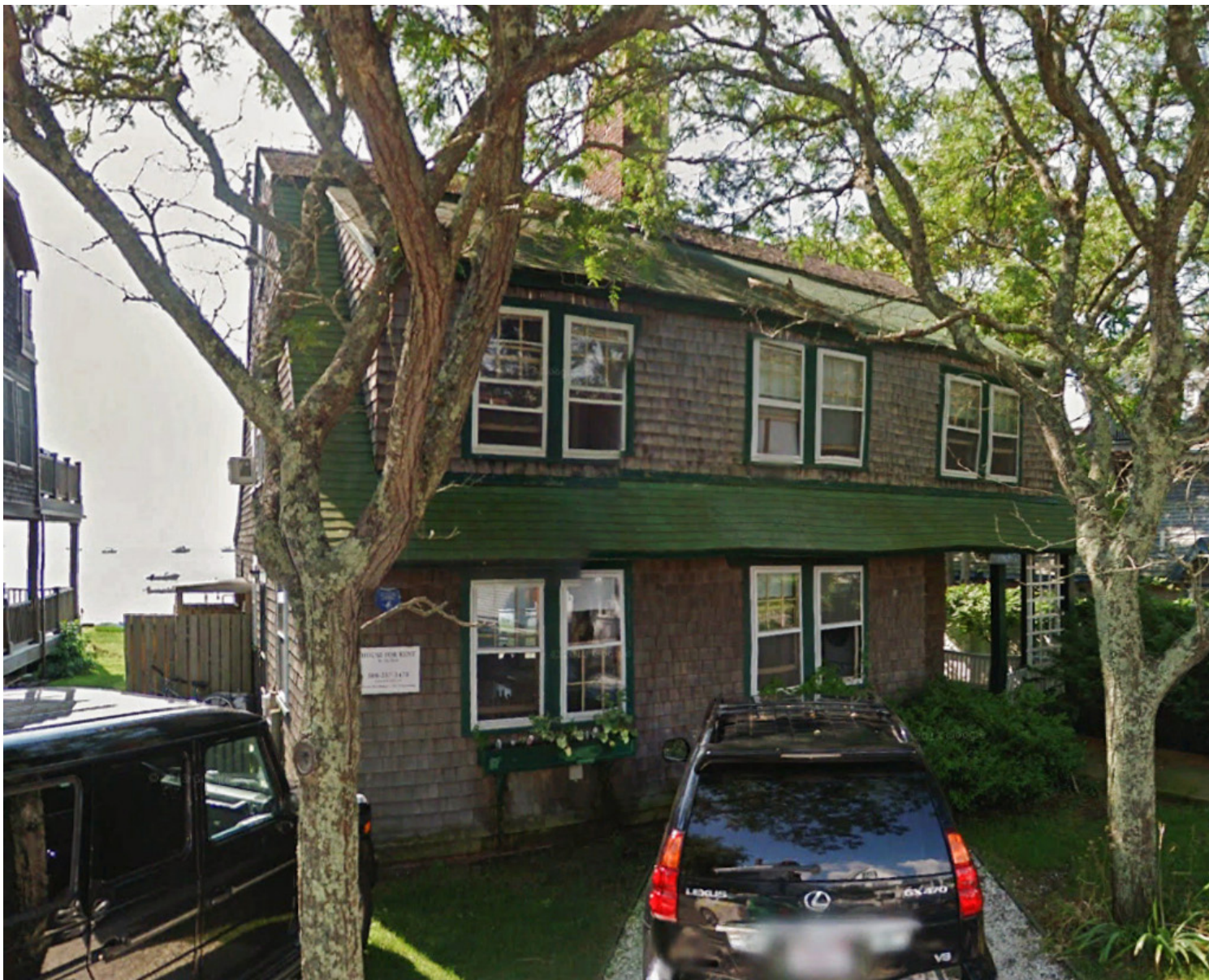
1 FOOT ABOVE SEA LEVEL