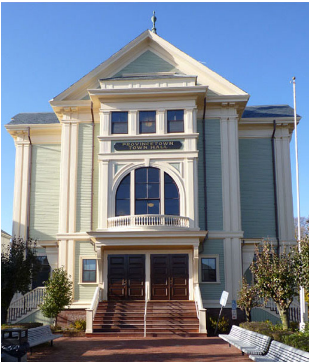
6 FEET ABOVE SEA LEVEL